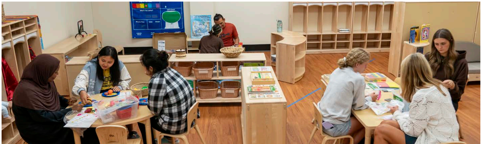
Students planning developmentally appropriate lessons