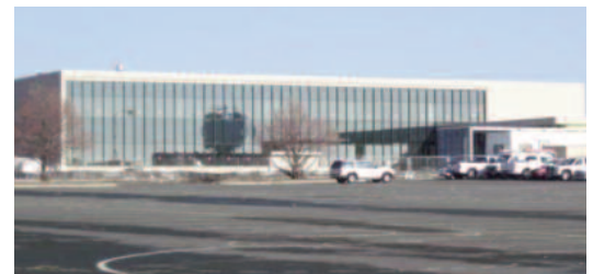
Law Enforcement and Criminal Justice Education Center (LECJEC) in Brooklyn Park opens for classes in fall 2010.